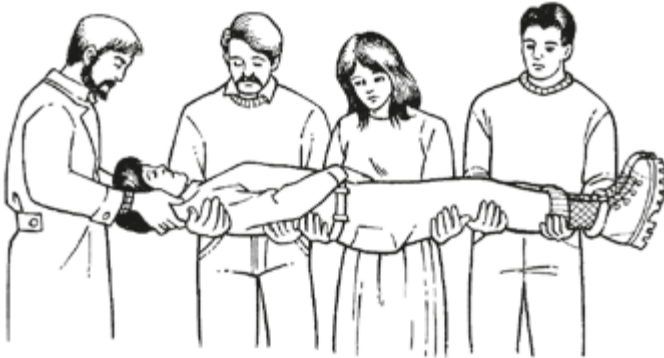
Safety transfer in case of spinal lesions